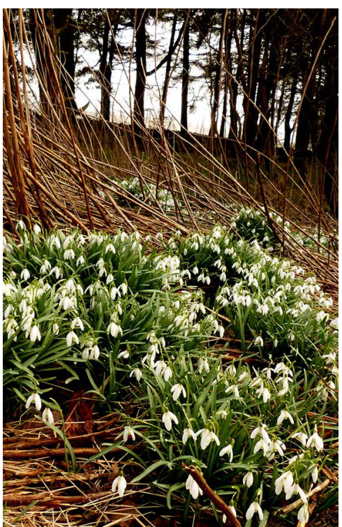
Snowdrops in Shillito Wood